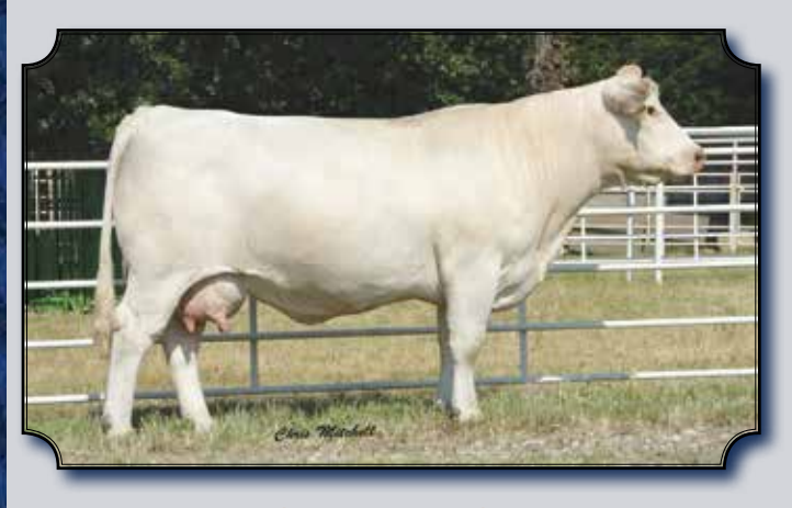
WEAVERS VERONICA 1040 DAM OF LOT 11