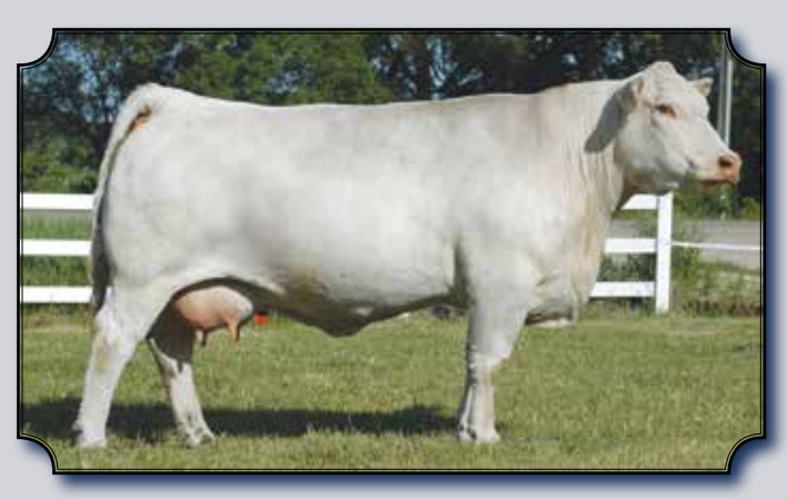
M6 MS E46 DUKE 248 P ET FABULOUS DONOR & FULL SISTER TO LOT 69