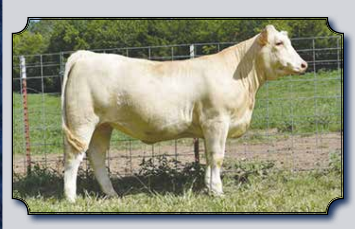
CS MS 10 DUTTON E45 P SELLS AS LOT 53