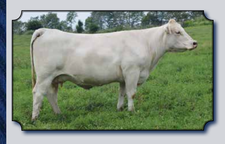
BARA MS 835 PRES LADY 12A ET SELLS AS LOT 18