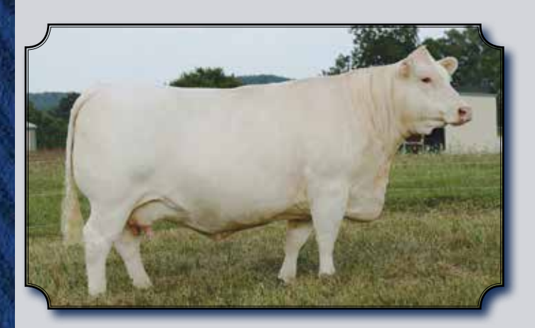
WIA MISS SMOKING LADY DONOR DAM OF LOT 28 EMBRYOS