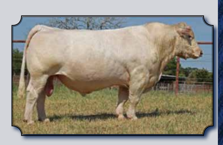
Mb Cool Rep 8101 HIS SERVICE SELLS