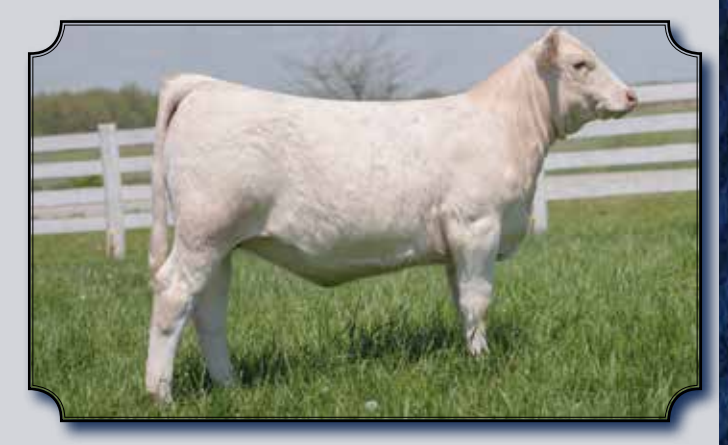
AC MISS X-CELLENCE 17-10 SELLS AS LOT 25

Long Hall Cattle Co. "Arrowhead Charolais