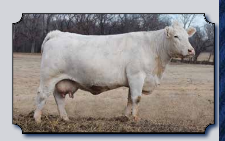
DS MS CUKTIN VEKNA 1002 DONOR DAM OF LOT 9 EMBRYOS

Another big, powerful, heavy milking Curlin daughter in the Sullivan program. Notice the great JWK Verna E225, the $50,000 donor at Three Trees that had a major influence on that top herd. Lemmon Actress X140 produced several $10,000 daughters that were very consistent in production. This donor ranks in top 15% for WW, and YW, 20% Milk, 10% MTL, 1% SC, 3% CW, and 20% TSI for breed EPDs. Quite a cow to build a program around! Sullivan Charolais