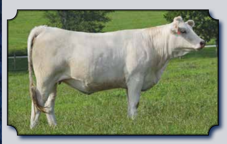
RS MS FIRST LADY E30 SELLS AS LOT 10