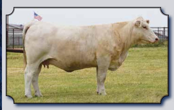
HEH MS ASI PERFECT HB46 ET DAM OF LOT 75