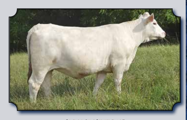
AKF JOSI JANINE 10D SELLS AS LOT 31