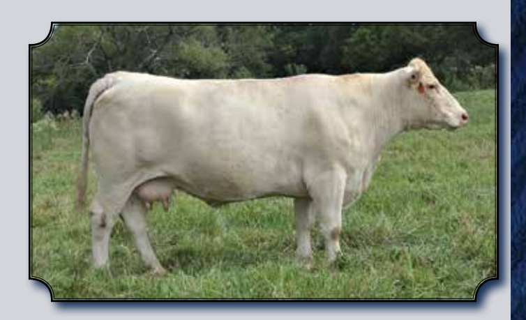
VPI TIARA 1064 SELLS AS LOT 48