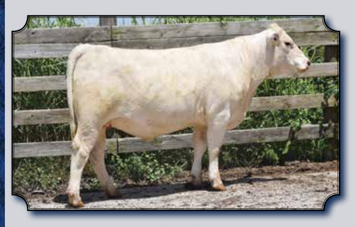
PLMS SLAM DUNK 673 P SELLS AS LOT 23