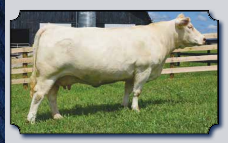
BHD MS CURTIN X292 DONOR DAM OF LOT 39