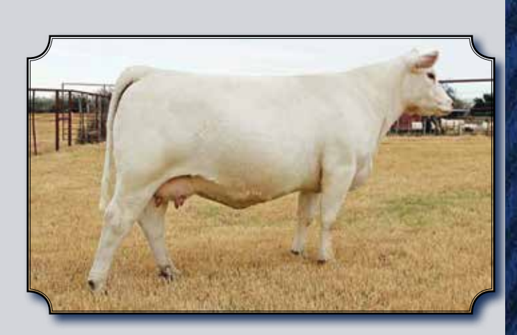
M6 MS NEW FIRE 3105 P DONOR DAM OF LOT 44 EMBRYOS