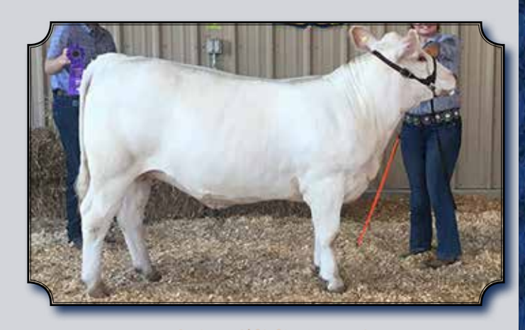
TLT MS GUARANTEE 1710 P SELLS AS LOT 55