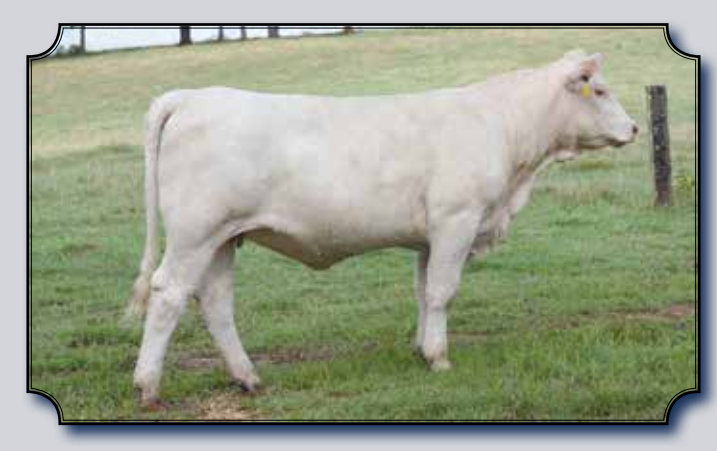
JBC MS PRESIDENT 703 P.ET SELLS AS LOT 37