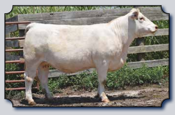
PLMS SLAM DUNK 685 P SELLS AS LOT 24