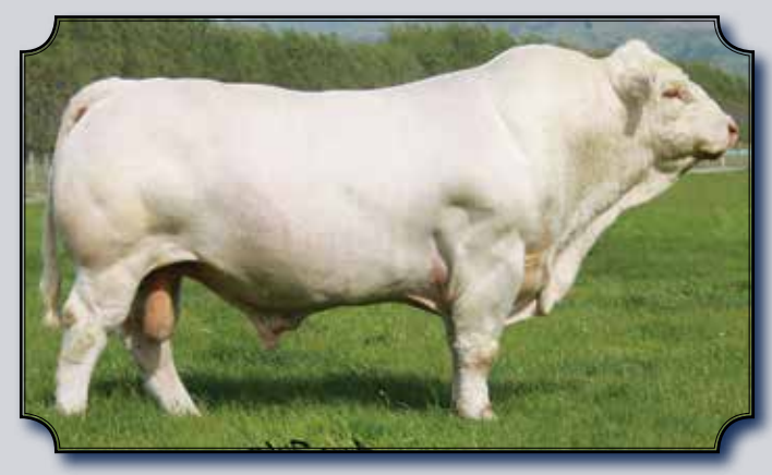
SILVERSTREAMEVOLUTION E HIS SERVICE SELLS!