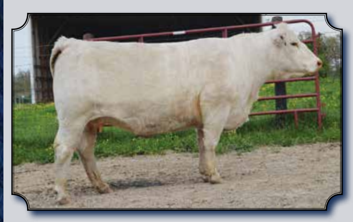
BGC MS MERCEDES 210B ET SELLS AS LOT 51