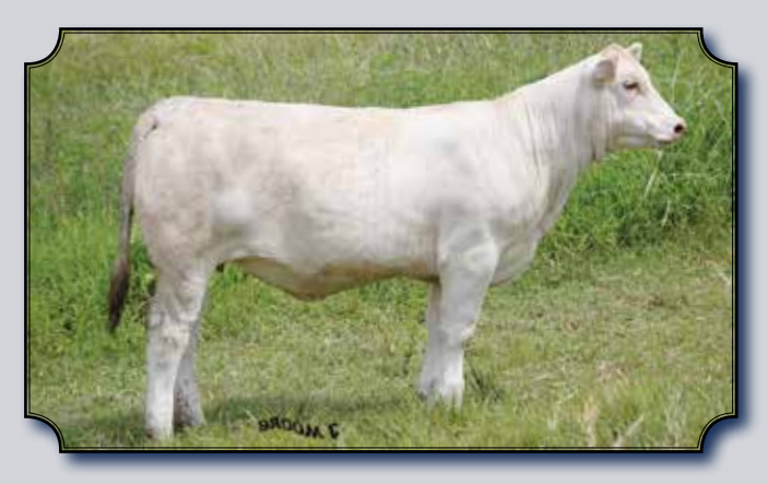
WEAVERS DOKIS 1723 SELLING AS LOT 26B