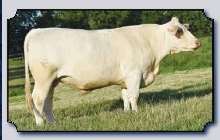
CS MS DUTTON D439 SELLS AS LOT 16