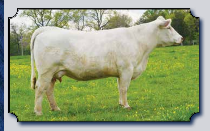
BGC MS BERTHA GOO 9462 SELLS AS LOT 52