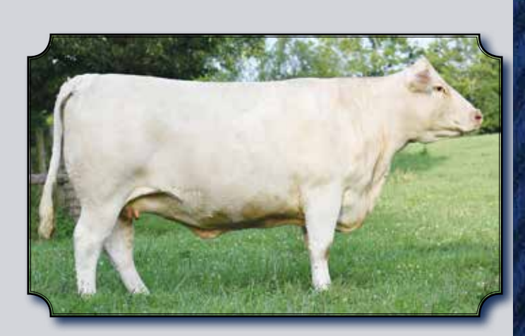
OKK'S MS NANCY 328P SELLS AS LOT 4

Al 3/26/18 to JDJ Smokester J1377 P ET; checked safe. This beautiful. young cow is in her prime! She ranks in the top 15% for WW, YW, Marb. and TSI for breed EPDs. A front-pasture cow, this cow has the proven pedigree of the Nancy cow family, blended with 9108, a real brood cow maker to solidify her genetic makeup. Smokester have become some of the most sought after brood cows in the breed, and the Nancy combination the most sought and should enhance her value! Sullivan Charolais