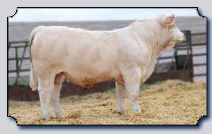
JDJ EOUITY 2370 P HIS PROGENY SELL