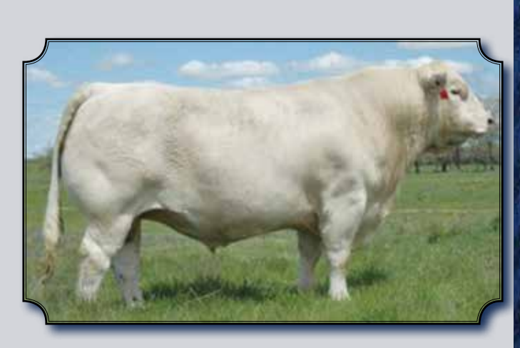
IT BILLEGRASS 4017 P HIS PROGENY SELL!