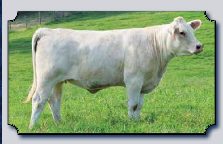
AC BETTY'S ASSET E 703 ET P SELLS AS LOT 12