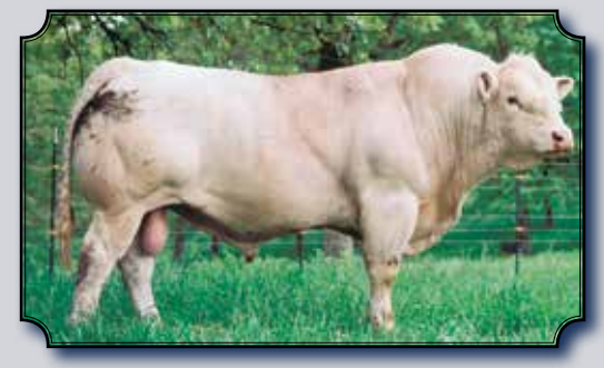
JDJ SMOKESTER JI377 P ET