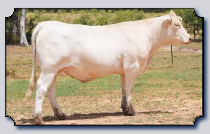
RE MS E46 DYNASTY 640 ET SELLS AS LOT 63