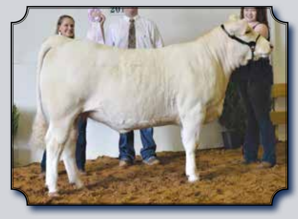
MDL MISS PERFECT FIRE 76 P SELLS AS LOT 42