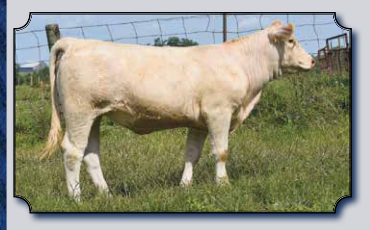
CS MS AG EQUITY EISP SELLS AS LOT 6