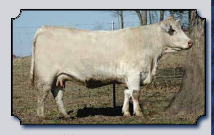
BARA MS MO9 PRESIDENT 134 P Donor dam of lots 7 & 8 embryos