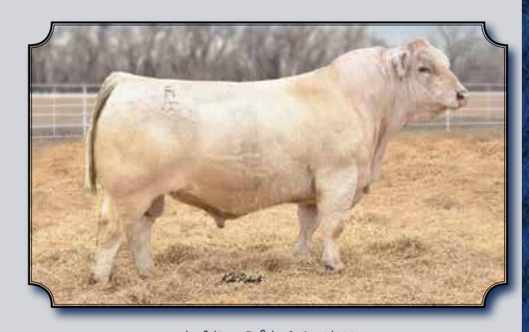
RBM FARGO YIII HIS SERVICE SELLS!