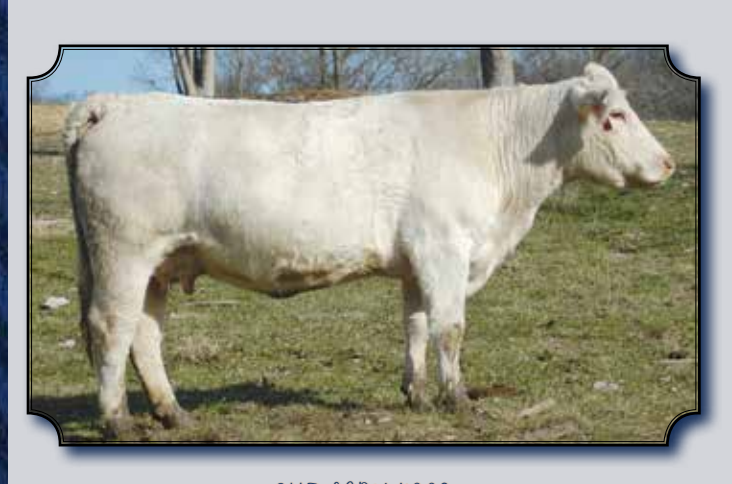
OHF LADY KOOS DONOR DAM OF LOT 35