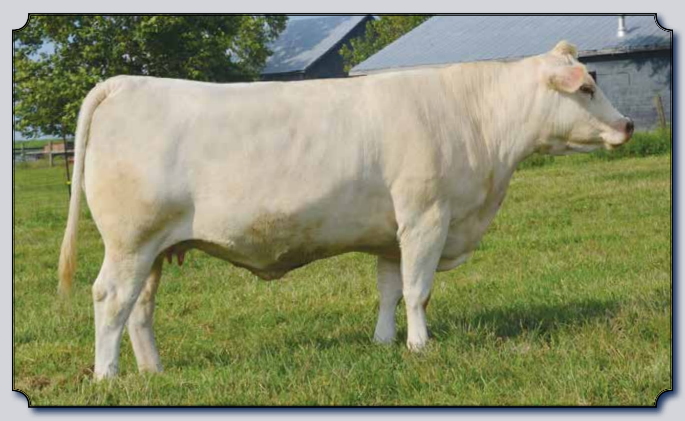
MD MS CURLIN 4D5 Sells as Lot 1