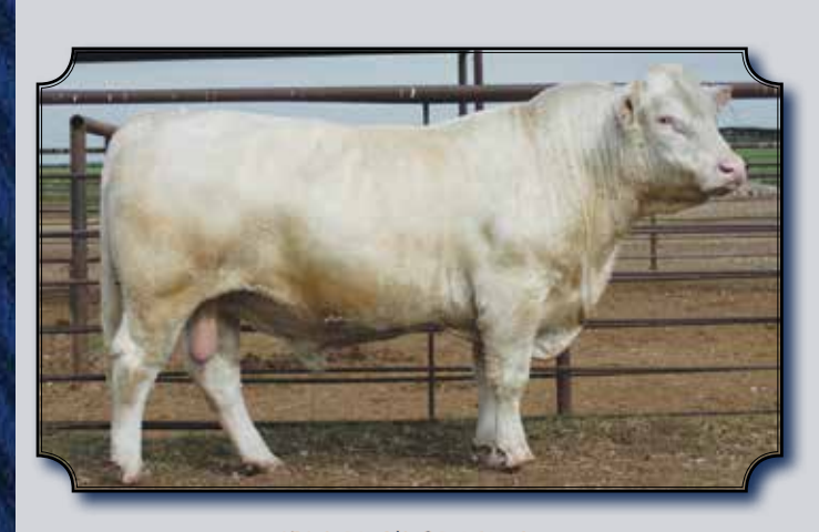
LDI RESOURCE 2365 P HIS PROGENY SELL!