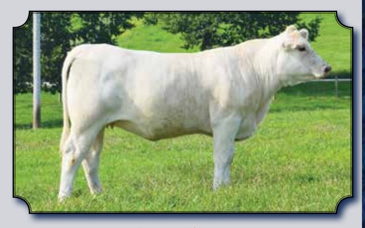
CS MS ZEUS Z E3 SELLS AS LOT 13