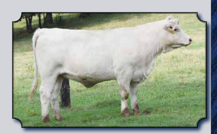
JBC MS PRESIDENT 709 P/S ET SELLS AS LOT 37