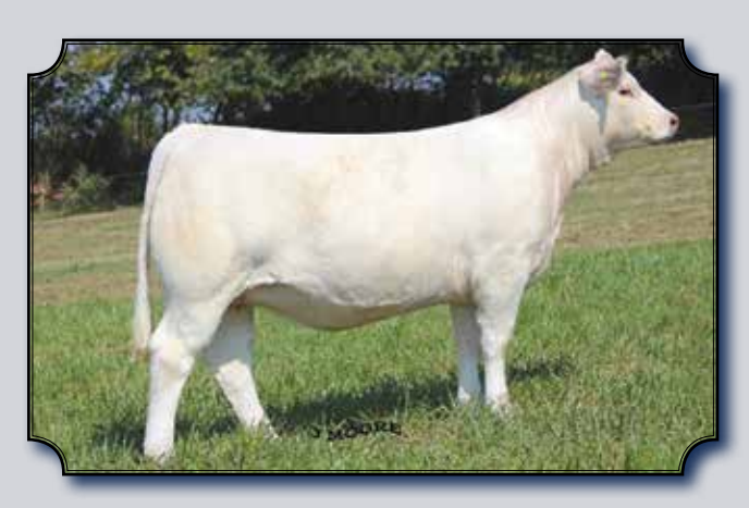
P) MS. PERFECT LADY 598 P DONOR DAM OF LOT 29 EMBRYOS