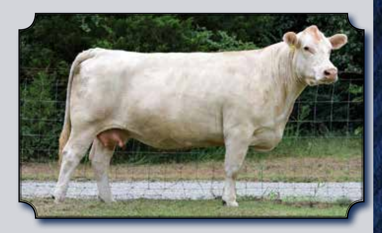
OHF VANESSA GIZZ ET DONOR DAM OF LOT 60