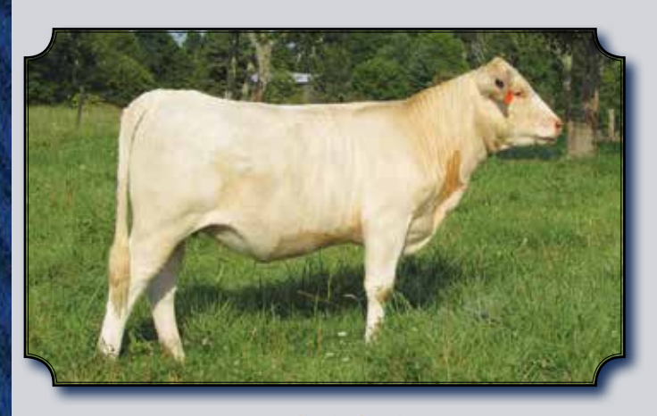
THI BRENDA'S CLARICE EI3 P SELLS AS LOT 58