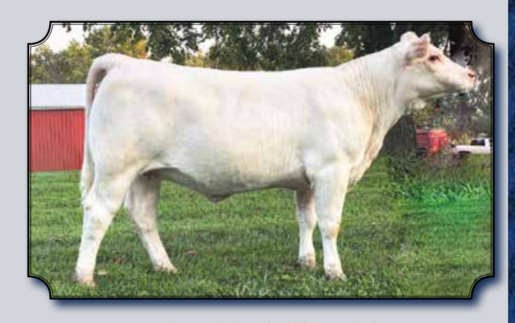
HF MISS PERFECT LADY 2738 P SELLS AS LOT 20