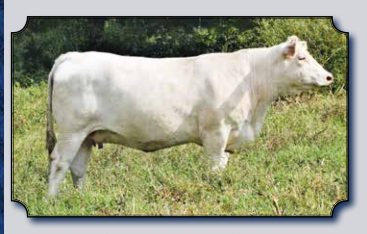
REAVES WHITE SMOKE LADY 324 SELLS AS LOT 46