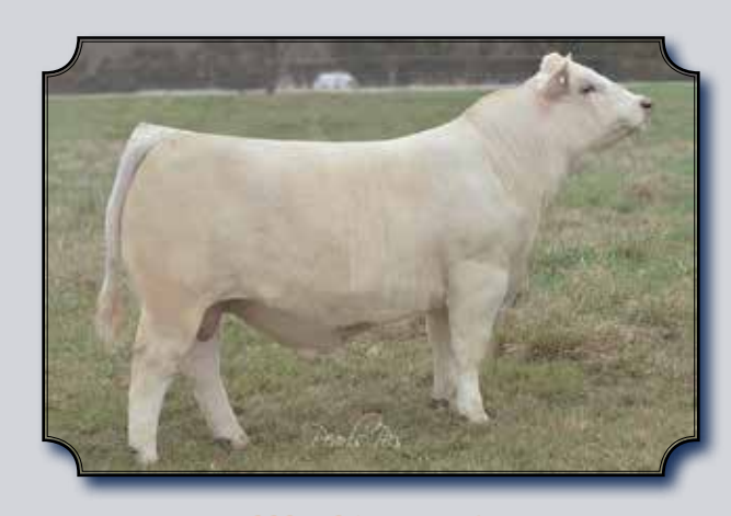
CCC WC Resource 417 HIS SERVICE SELLS!