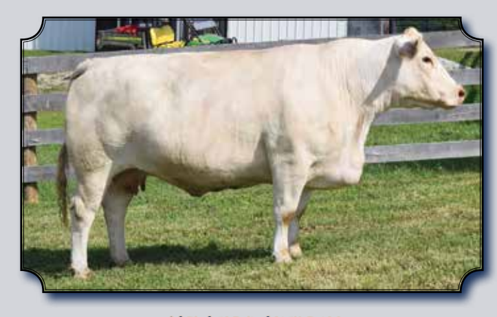
JAFRAISE MAXINE 180 SELLS AS LOT 3