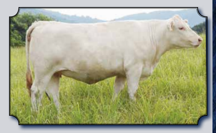
AKF CONSTANCE CHLOE 13D SELLS AS LOT 30