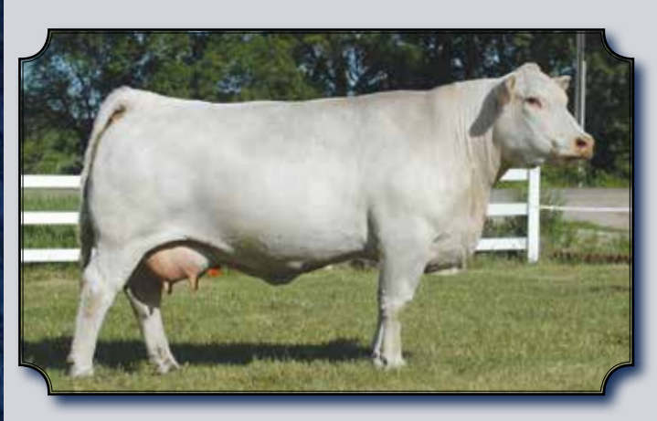
M6 MS E46'S DUKE 248 PET MATERNAL GRANDDAM OF LOT 27 EMBRYOS