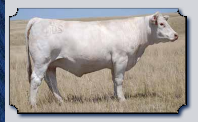
LDI MS CIGAR B2011 P ET DONOR DAM OF ET CALVES SELLING AS LOT 64