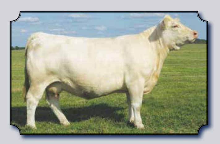
OBG ESVIRA 4303 PSD DONOR DAM OF LOT 70