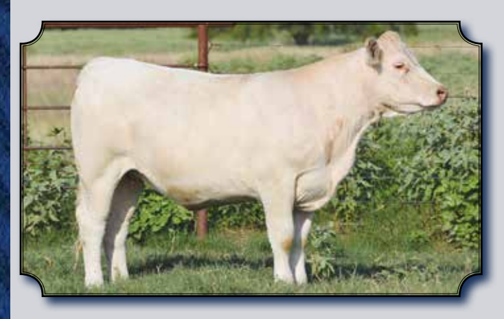
HEH MS MAX ON ESO P SELLS AS LOT 76