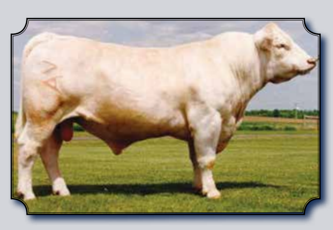
VCR SIR DUKE 914 PLD HIS PROGENY & SEMEN SELL!