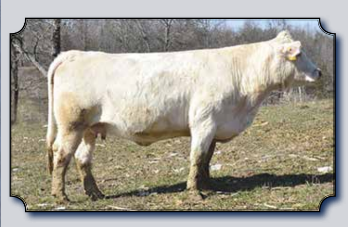
KTR MISS JUGGER C 276 DONOR DAM OF LOT 41 PREGNANCY