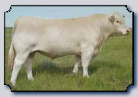
LT LEDGER 0332 P