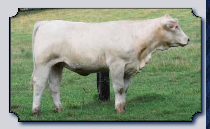
JBC MS CIGAR 717 P.ET