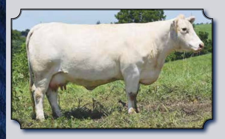
P) MS NEW PHEZPS 444 P SELLS AS LOT 22