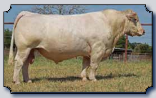
M6 COOL REP 8108