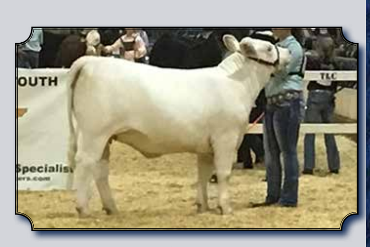
TET MS GUARANTEE 1735 P SELLS AS LOT 56