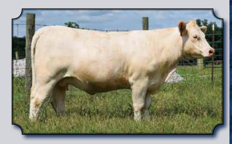
JBC MS OUASITY MAX 606 P.ET SELLS AS LOT 14