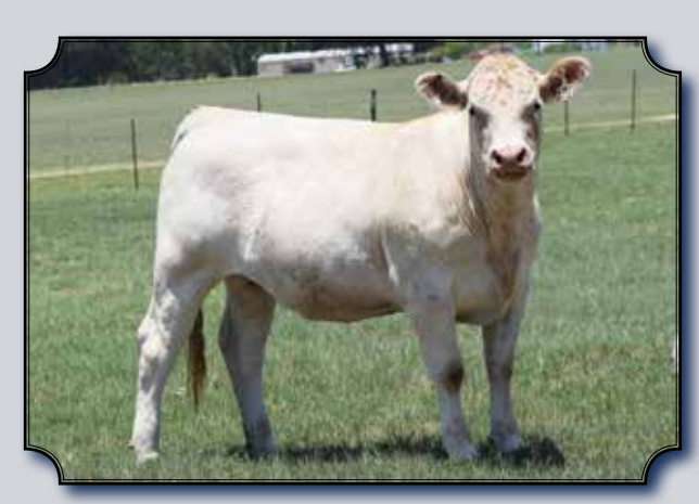
BARA MS 224 SMOKIN 17E P SELLS AS LOT 68