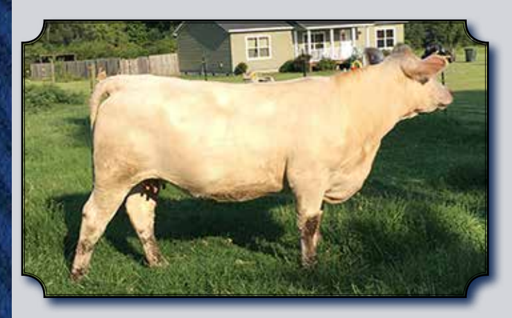
RE MS DYNASTY 566 ET SELLS AS LOT 34