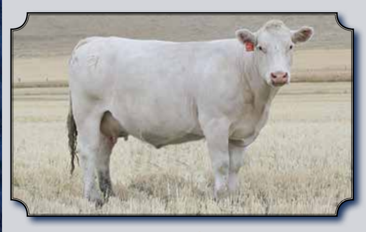
JDJ MS CIGAR KI509 dam of jdj curlins3012 & Jdj royal trade n134

CE BW WW FAT MARB REA -0.013 -0.01 198.29