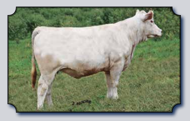
WEAVERS DOKIS 1713 SELLING AS LOT 26A