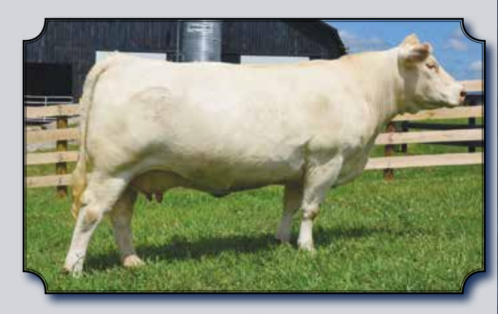
BHD MS CURTIN X292 DONOR DAM OF LOT 19 EMBRYOS