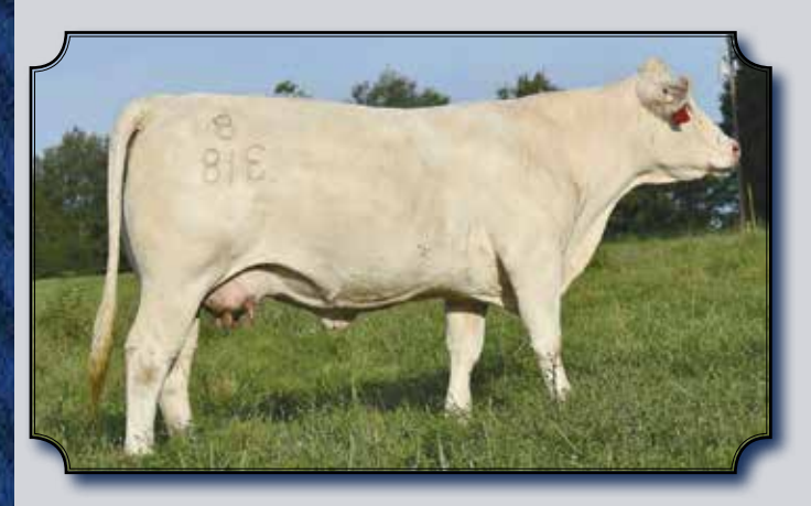
KCM MS SMOOTH B318 SELLS AS LOT 17