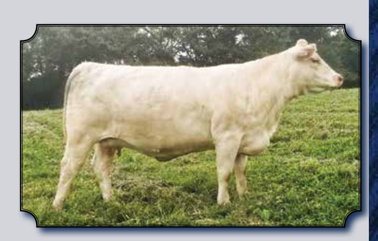
PLMS FRESH AIR 4104 SELLS AS LOT 21

Sells bred AI and due before the sale to CCC WC Resource 417. Very complete, feminine, smooth-made stylish brood cow with good numbers. Ranks in the top 15% for CE, 10% BW, 25% WW, 20% YW, 35% MTL, and 15% TSI for breed EPD comparisons. Well designed udder enhances her maternal ability. The reputation of the Resource offspring is tremendous eye-appeal, great milking daughters and consistent production. Harrod Family