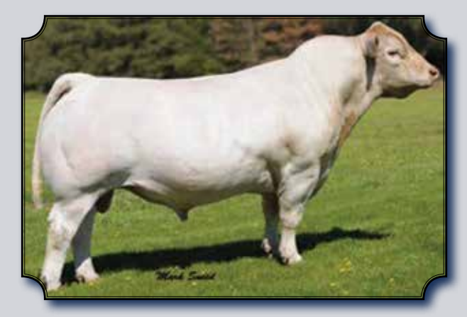
TR MR FIRE WATER 5792KET HIS PROGENY SELL!