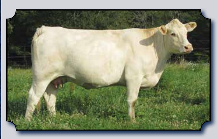
BAMBOO MS NANCY SOIIT 5331 ET SELLS AS LOT 57