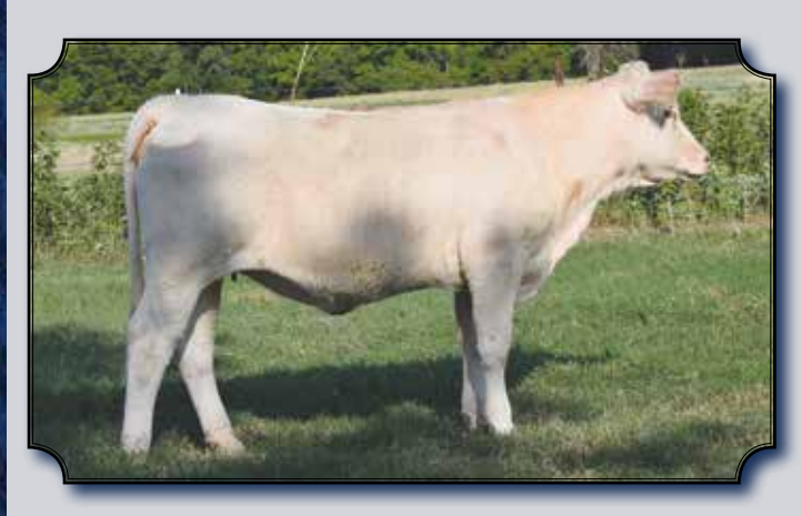
HEH MS CIGAR IJJUSION EII6 SELLS AS LOT 77