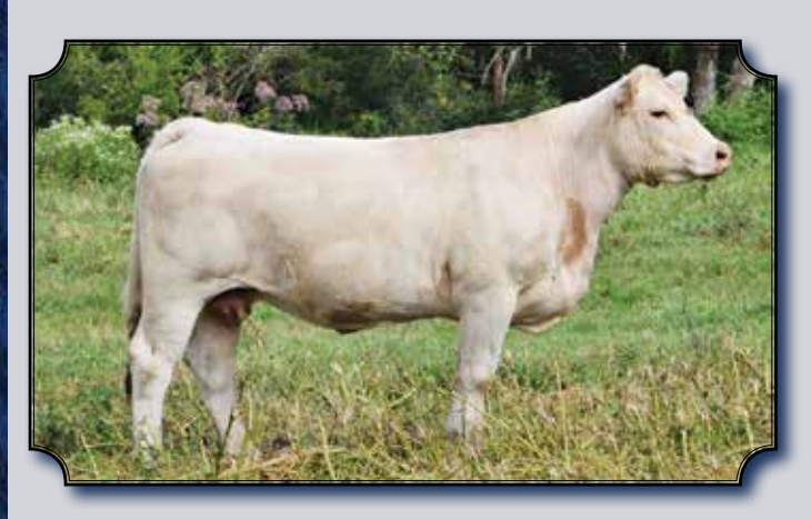
KEAVES MS LEDGER 327 SELLS AS LOT 47