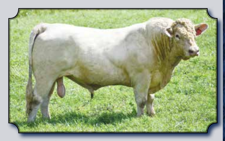
CS WILLPOWER D 32 P ET SENIOR HERDSIRE AT SULLIVAN CHAROLAIS

CE BW WW YW MILK MCE MTL SC CW REA FAT MARB