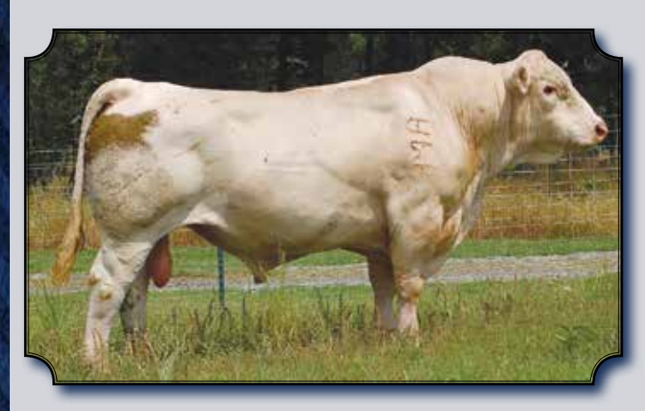
WCK SIR DUKE 7340 P HIS PROGENY SELL!