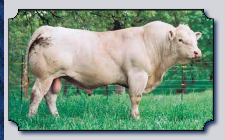
LDI SMOKESTER JI377 P ET HIS PROGENY SELL!