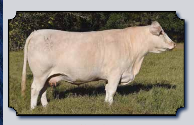
BHD DS RACHEL ALEX 950 ET DONOR DAM OF LOT 65 EMBRYOS