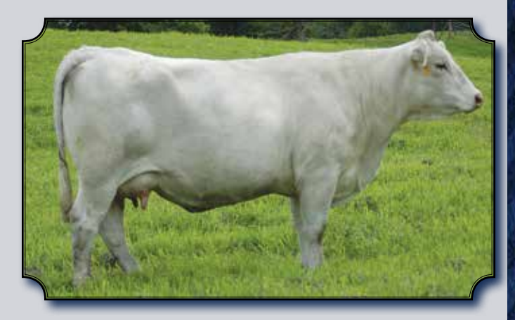
DED MS CLARICE 2809 PLD ET DONOR DAM OF LOT 66