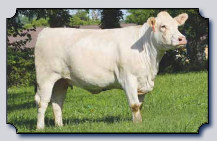
HF FIRST LADY BISIT ET SELLS AS LOT 5