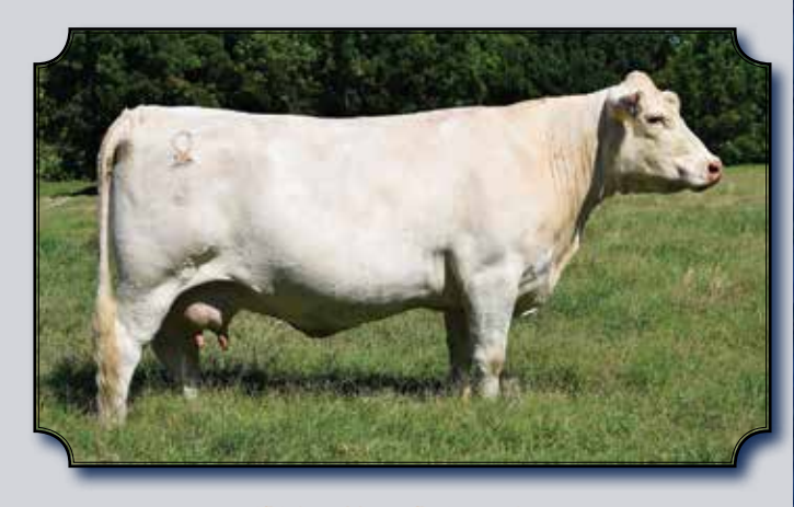
JDJ MS PRESIDENT W3071 DAM OF LOT 61