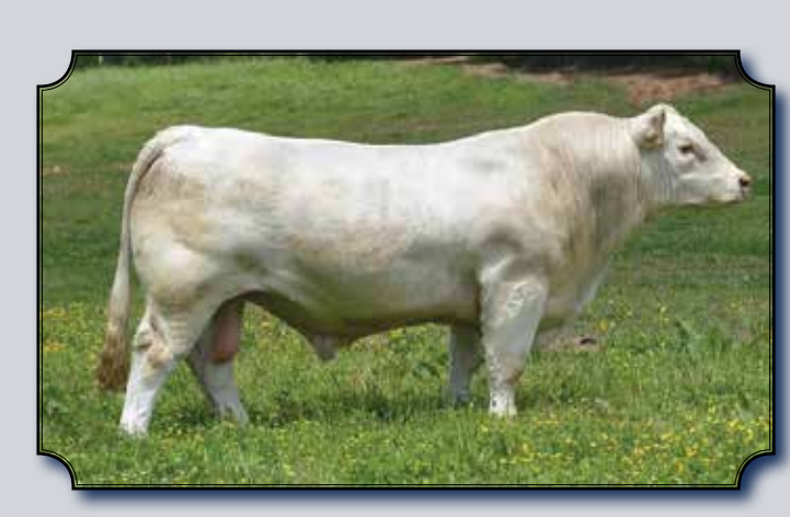
JDJ MAXIMO A18 P HIS PROGENY & SERVICE SELL!

Due 10/24/18 to RBM Fargo Y111. Out of the great "nick-mating" of Duke 914 on a Cigar cow that has worked so successfully. She excels in CE and BW EPDs, rates good in growth, performance, MTL and TSI for the breed numbers. Combine her numbers with Fargo and you will have an exceptional EPD offspring! This young coming first-calf heifer offers superb profit potential and the strong homozygous polled influence of Maximo!