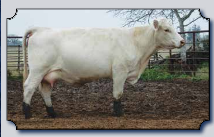
WM MS AGATHA FAB MO9 P ET DAM OF 13Y SIRED BY WCR SIR FAB 809 X NF AGATHA 9581

Al 6/5/18 to JDJ Curlin S3012. Very special daughter of the main Donor cow at Sullivan's, 13Y, a President daughter that traces to Mac 809 and Agatha 9581, one of the greatest in the breed. Candy loves the Equity daughters, they milk with great udder quality, calve easy and have abundant style and clean lines. The Curlin mating enhances the value tremendously in this top prospect. Shown at a younger age, but had a 728 lbs weaning weight.