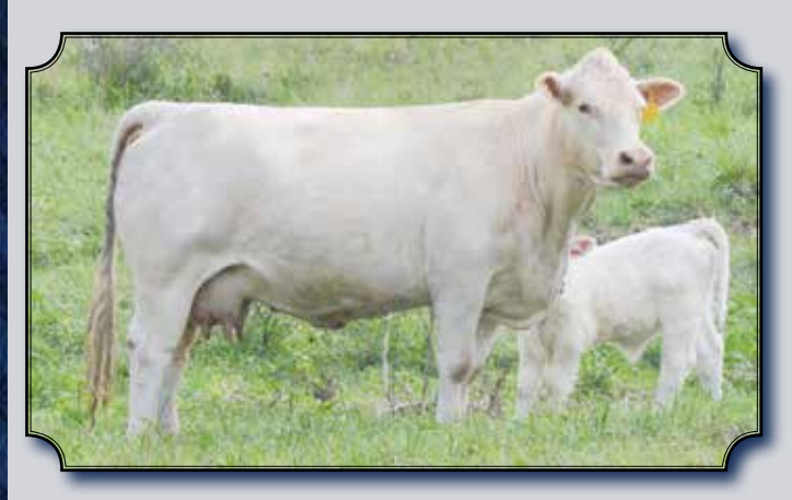
M6 M8 FRESH DENSITY 233 P SELLS AS LOT 45 & 45A